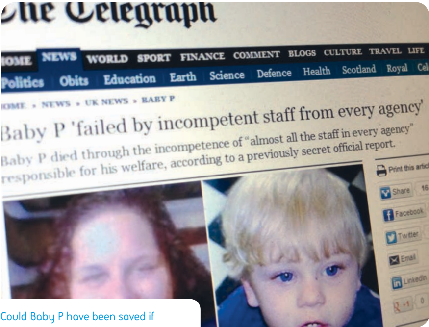
Could Baby P have been saved if services had engaged more effectively with the men in his life?

But research shows that the men’s attitudes and behaviour are only part of the picture. Just as important (some would say more important) is how the practitioners and their institutions approach the men. It is that issue we address in this Good Practice Guide. When men’s behaviours are violent and oppressive, risk to family members’ safety is of course direct and immediate. Managing and addressing these risks is crucial – not only for immediate family safety, but also for other women and children with whom such men are interacting, or will, interact.