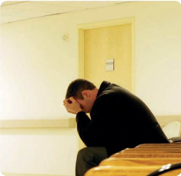
Children's services should seek to identify and involve the father as early as possible, unless to do so is assessed as unsafe

However, little is done with this information. The father's legal status in relation to his child may not be recorded, and there is rarely information to show whether attempts have been made to contact him; to describe his personal qualities and circumstances, and the family and other networks attaching to him – all of which may prove to be important and useful.